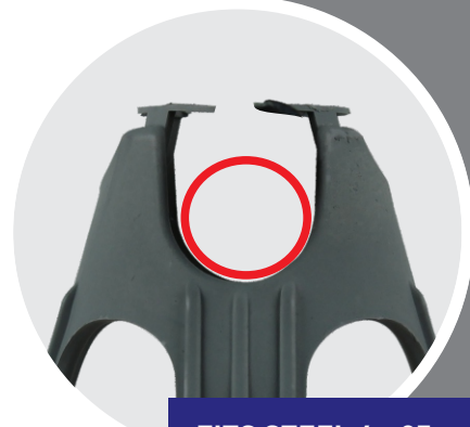
FITS STEEL 6 - 25mm

“What we like about Castle is they are always right there to help and have stock on hand”