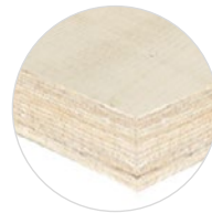
Laminated Veneer Lumber - LVL